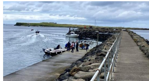
Boats heading out during the July angling contest.

Fund. SCT would like to thank the council and Scottish Ministers (The Department) for being supportive and willing sellers, with the role of Highlands and Islands Enterprise being particularly crucial, via its support of its development officer post via the Community Capacity Programme.