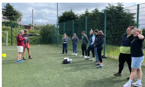
Columba 1400 facilitators in training.

September brought more excitement as we held the annual Tractor/Car Run to raise funds for Cancer Research UK. We also took part in The Big Scottish Breakfast for STV's Children's Appeal by hosting a 'Big Scottish Breakfast For Dinner' event, helping to raise money for children at risk of hunger across Scotland.