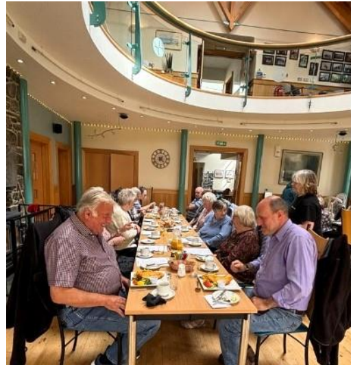
Staffin Senior Citizens' monthly meal.