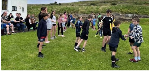
Fèis tutors and youngsters outside Columba 1400.