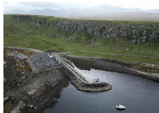
Aerial photo from September shows extent of new hardstanding area built at the harbour.

me and the other harbour users as I have had to trailer water in IBC containers and I use at least two every time (2,000) litres. The water is not suitable for drinking at present as we have to fit a spring chamber, filters and tanks and then get it tested for human consumption.