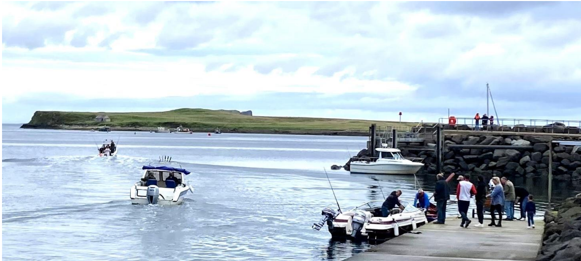
Staffin Harbour Angling Competition July 2025.