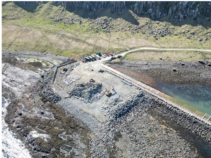
The harbour onshore area taking shape in spring 2024.

Project Funding - SCT secured grants from the UK Shared Prosperity Fund (harbour safety equipment and water supply); Community Regeneration Fund (leases for harbour units) and the Islands Programme (construction of new harbour facilities building and civil works).