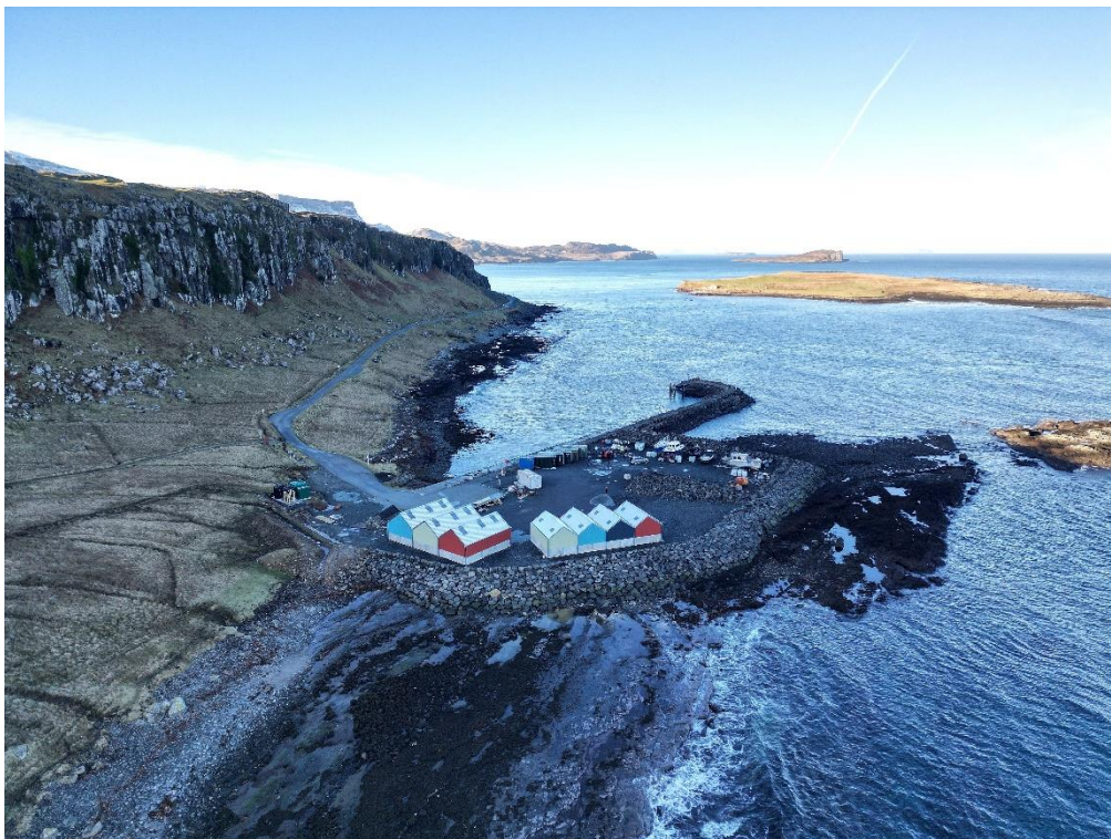
The new business units at the community-owned Staffin Harbour, January 2025.