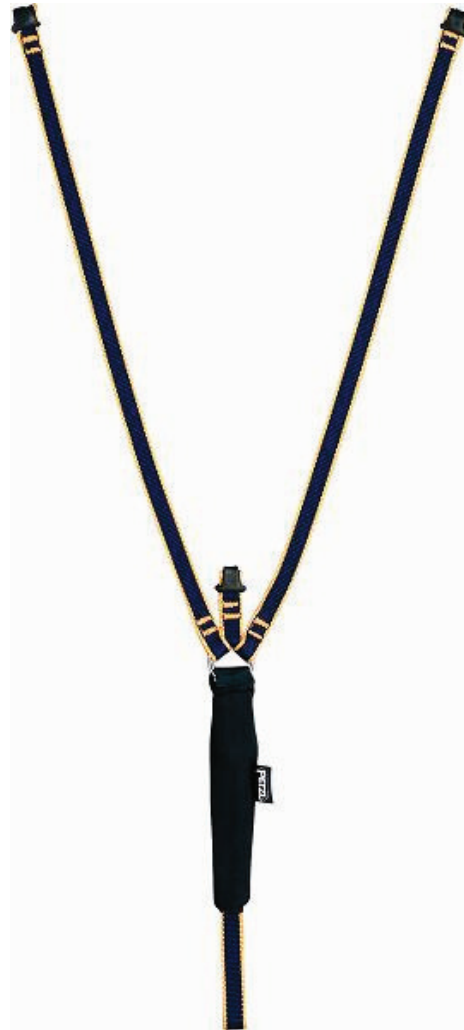
SCORPIO L60 2002 to 2005