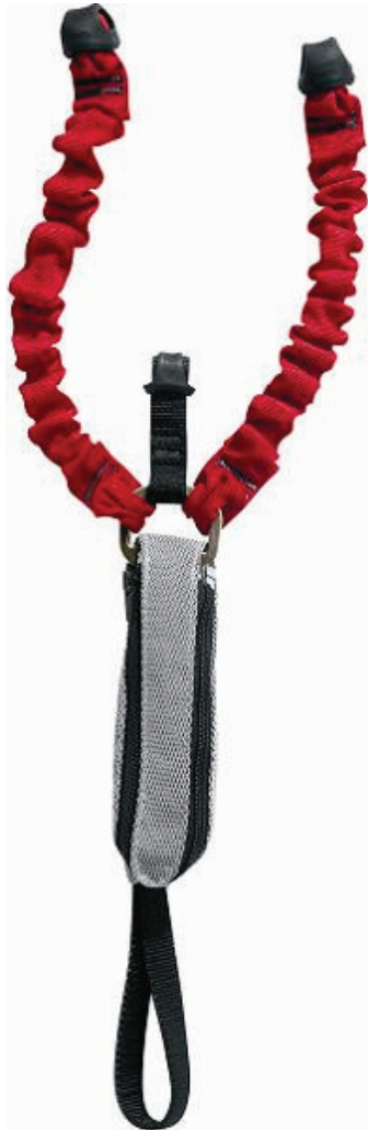
SCORPIO L60 2005 to Present