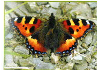
Small Tortoiseshell Resident. March to October.