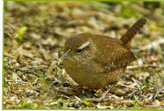
Wren Resident. All year. Hedgerows and gardens.