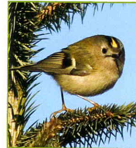
Goldcrest Ireland's smallest bird. Resident. All year. All areas including gardens.