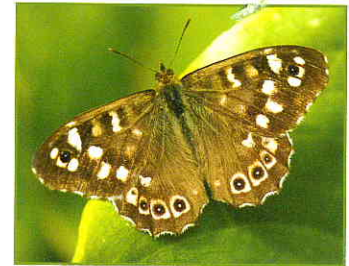
Speckled Wood Resident. March to October. All areas.