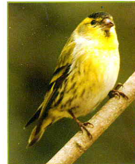
Siskin Resident. All year but easier seen in Winter when its visits gardens and feeders.