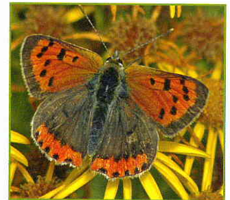
Small Copper Resident. April to October.