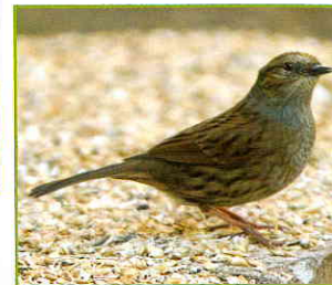
Dunnock Resident. All year. Hedgerows & Gardens. Visits feeders in Wintertime.