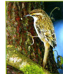
Tree Creeper Resident. All year. Where trees are growing. Feeds on grubs by climbing trees.