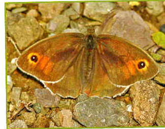
Meadow Brown Resident. June to September.