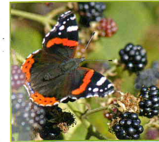
Red Admiral Summer visitor. April to November. Migrants from South Europe.