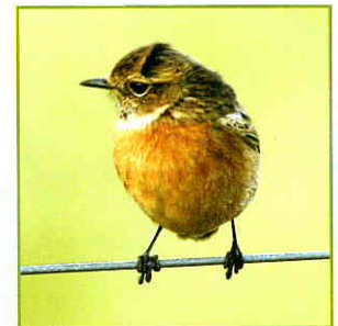
Songchat Resident. All year. All areas.