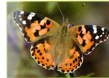
Painted Lady Summer visitor from North Africa.