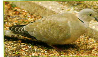
Collared Dove Resident. All year. Mainly seen near grain stores.