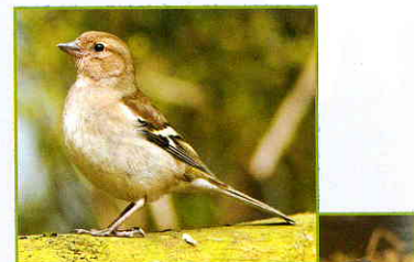
Chaffinch Resident. All year. All areas including gardens. Visits feeders in Wintertime.