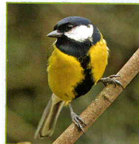
Great Tit Resident. All year. All areas including gardens. Visits feeders in Wintertime.