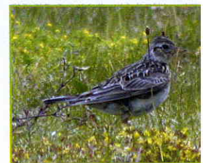
Skylark Resident. All year. All areas.