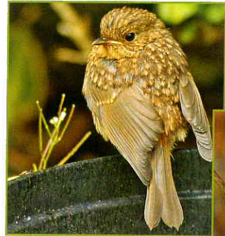
Robin Resident. All year. Countryside and gardens.

Q. What bird is this? Remember to always feed birds during the winter.