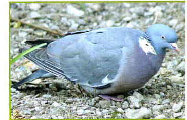
Wood Pigeon Resident. All year. All areas including gardens.