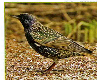
Starling Resident but large flocks migrates from Northern Europe each Winter. All year. All areas.