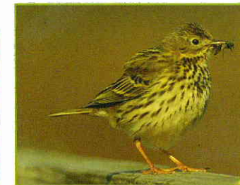
Meadow Pipit Resident. All year. All areas.