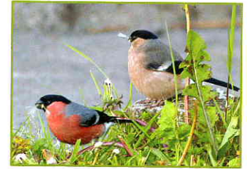
Bullfinch Resident. All year. All areas including gardens. Rarely uses feeders in Wintertime.