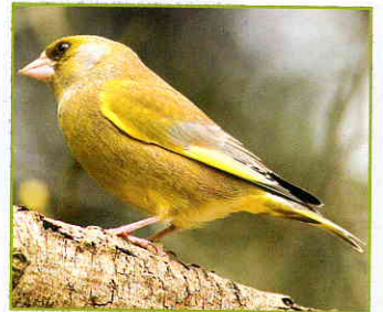
Green Finch Resident. All year. All areas including gardens. Visits feeders in wintertime when numbers increase with migrants from Europe.