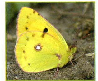
Clouded Yellow Summer visitor from the Mediterranean.