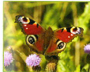
Peacock Resident. March to August.