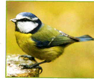
Blue Tit Resident. All year. Countryside and Gardens. Feeds from peanut feeder in Winter.