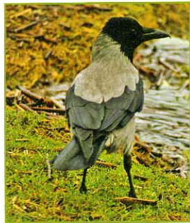
Grey Crow Resident. All year. All areas.