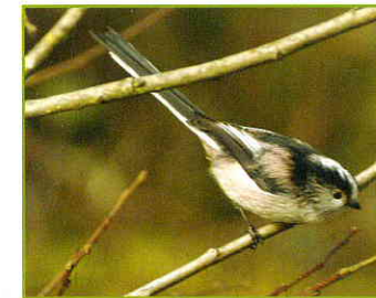
Long Tailed Tit Resident. All year. All areas where trees grow. Travel in small blocks.