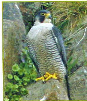
Peregrin Falcon Resident. All year. All areas. Areas where suitable nest sites are available.