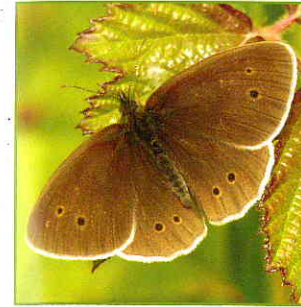
Ringlet Resident. June to August.