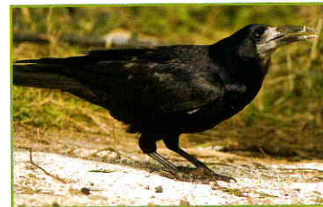
Crow Resident. All year. All areas.