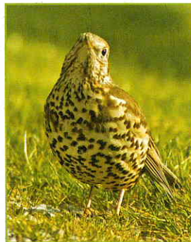
Mistle Thrush Resident. All year. All areas including gardens.