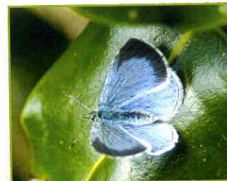
Holly-Blue Resident. March to September.