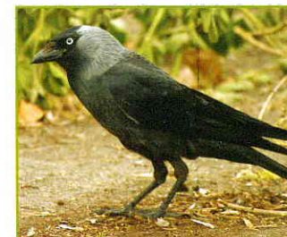
Jackdaw Resident. All year. All areas. Nests in chimneys.