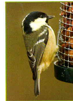
Coal Tit Resident. All year. All areas. Visits feeders in Wintertime.