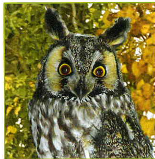
Long Eared Owl Resident. All year. In this area in Gristan Bog and in woods in Slieve Riadh. Young can be heard screeching in Summertime. Flies by night.