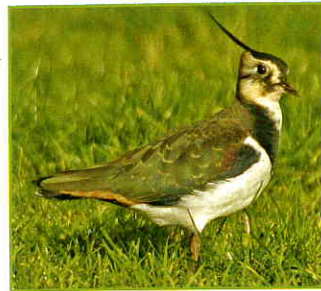
Lapwing Resident. Mainly seen in wintertime in flocks and fields.