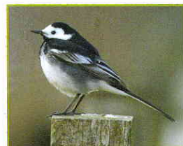
Pied Wagtail Resident. All year. All areas including gardens.