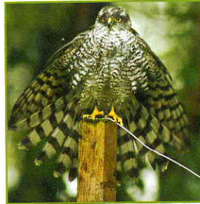
Sparrow Hawk Resident. All year. All areas. Bird of Prey.