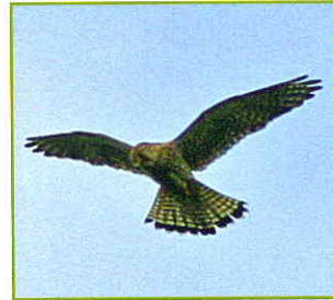
Kestrel Resident. All year. All areas.