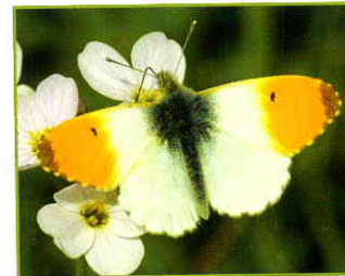
Orange Tip Resident. April to June.