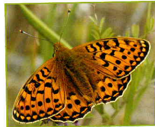
Dark Green Fritillary Resident. June to September.