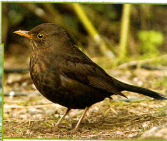
Blackbird Resident. All year. All areas including gardens. Visits feeders on ground during Winter.