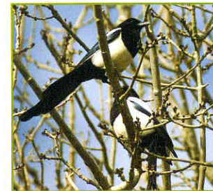
Magpie Resident. All year. All areas including gardens.