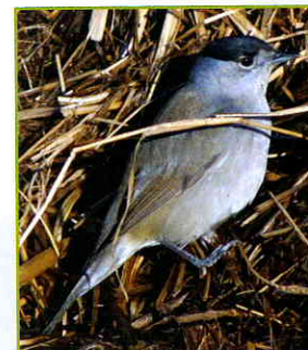
Blackcap Resident but numbers increase in Winter with migrants from Europe.