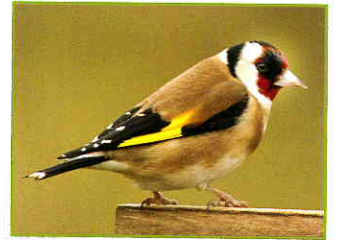
Goldfinch Resident. All year. All areas where seeds are present. Visits feeder in Wintertime.