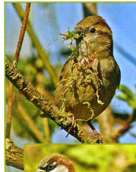
House Sparrow Resident. All year. All areas including gardens.