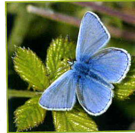
Common Blue Resident. April to October.