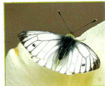
Green-Veined White Resident. April to September, All areas.