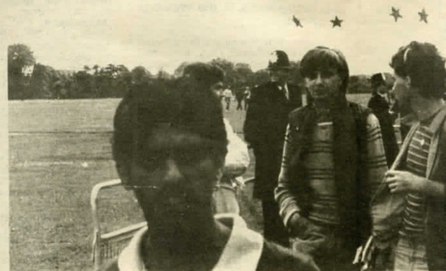
Homosexuality 30s-style in Another Country . And 80s-style in the street out side...