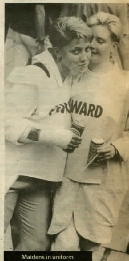
Maidens in uniform