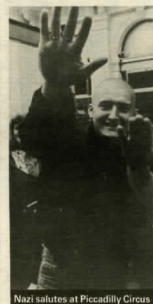
Nazi salutes at Piccadilly Circus