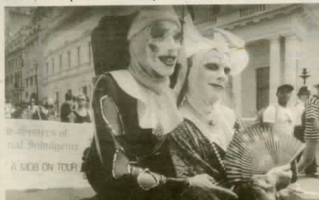
Paris sent its own sisters