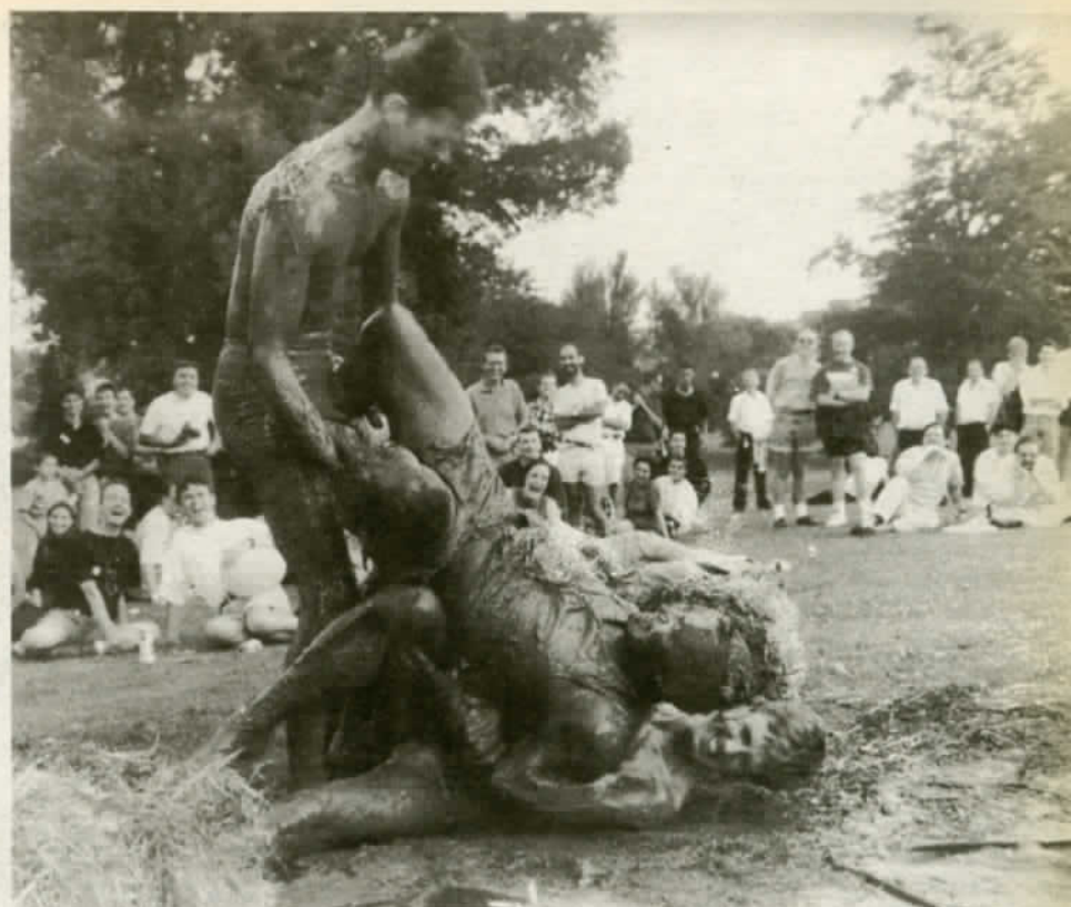
Mud wrestlers provided entertainment