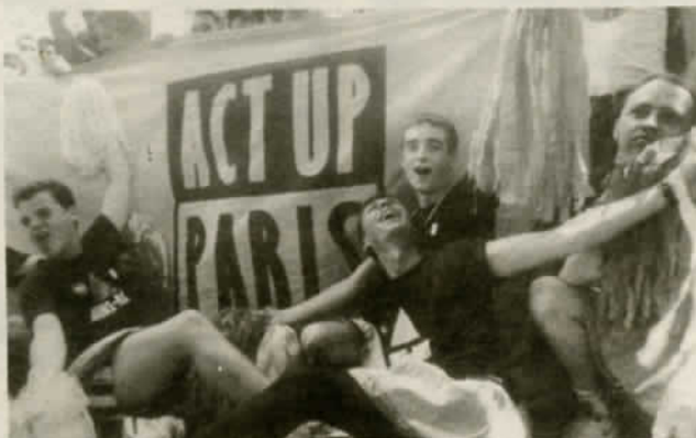
'Oh, la, c'est Capital Gai ...'

Europride 92; Lesbian and Gay Pride; The Quilt; Names Project; Partyrama; International Lesbian and Gay Association; Lesbians and Gays Fighting Racism and Fascism; Gay Youth, Manchester; Zamimass; Revolutionary Internationalist League; Older Lesbian Network; Wages Due Lesbians; North Western Wages Due Lesbians; Black Lesbian and Gay Centre; London Bisexual Group; Edinburgh Bisexual Group; Workers Power; Nottingham Bisexual Community; Brighton Bisexual Community; Dragons Club; Deaf Gays and Lesbians of Wales; Quaker Bisexual Group; Bisexual Centre Collective; London Bisexual Group; Labour Campaign for Lesbian and Gay Rights; Workers International League; Freedom of Sexuality; Bristol; National Lesbian and Gay Survey; Gay and Lesbian Humanist Association; Solent Pride; Out in Southampton; Croydon Area Gay Society; Streetwise Youth; The London Pink Dancers; Gay Bereavement Project; Hyde Park Gays and Sapphics; Gwynedd Gays; Hull, Fish City Dykes; Hackney Women's Football Club; AIDES, Paris et Ile de France; Lesbians and Gays in IPMS; Brighton Lesbian Strength; Pepys Plus; University of Sussex Lesbian, Gay and Bisexual Society; Northern Ireland Gay Rights Association; Irish Lesbians; Lesbians and Gays in MSF; Warwick University Lesbian, Gay and Bisexual Association; Ruby's, Harlow; Burton on Trent Gay Group; Orientations, Chinese