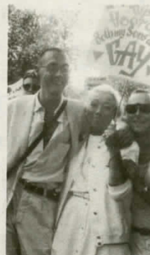
Mother and sons