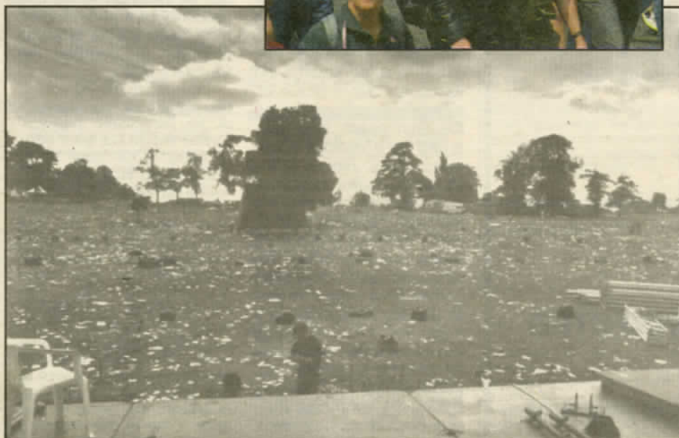
ABOVE Brockwell Park on Sunday: the morning after the day before

Screening for Sexually Transmitted Diseases. Lesbian