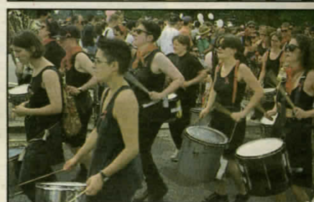
RIGHT Dyke drummers leading the march from Hyde Park