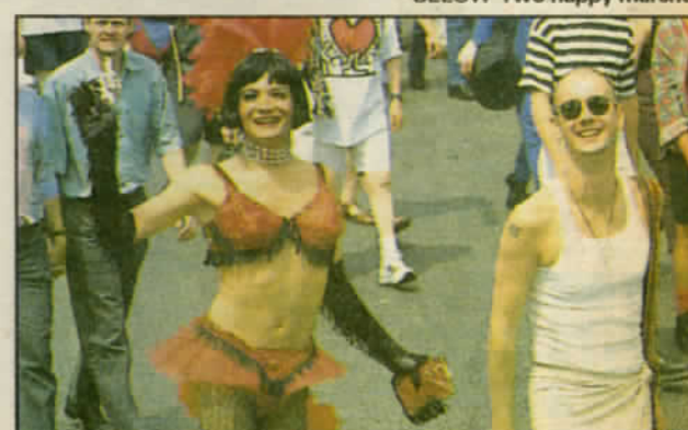
BELOW Two happy marchers