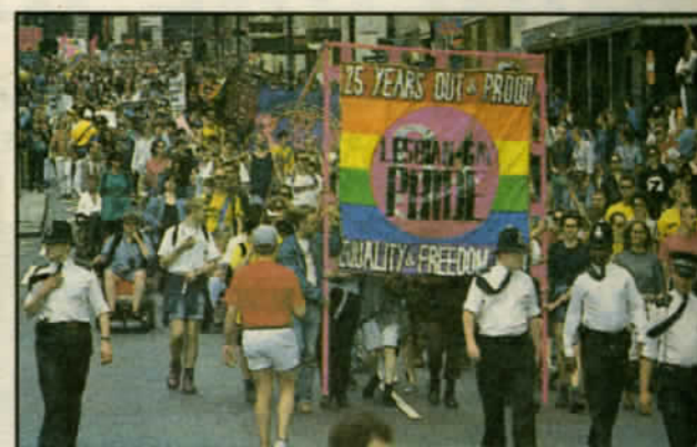
ABOVE RIGHT Remembering 25 years since Stonewall