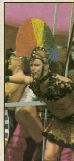
ABOVE Another rainbow