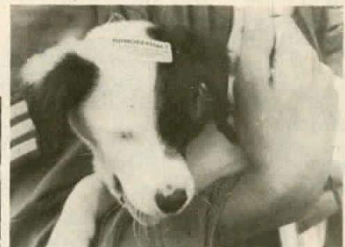
A 'woofter' in Edinburgh at the Gay Pride celebrations