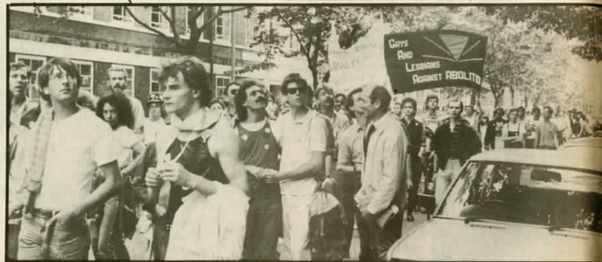
Scenes from this year's Gay Pride March in London