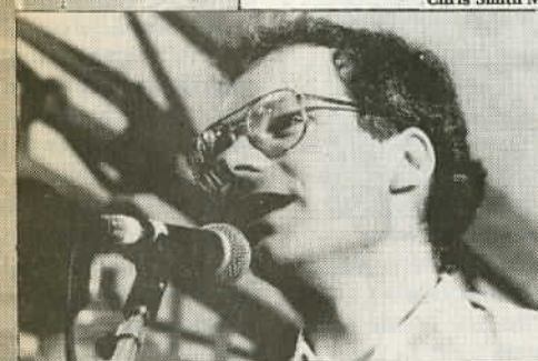
Chris Smith MP