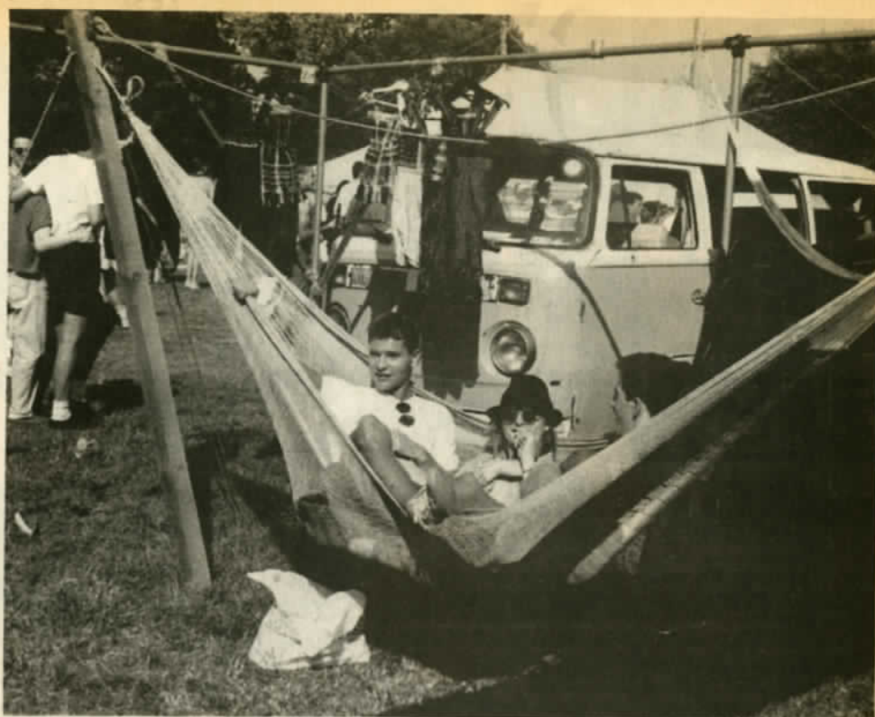
HAMMOCK FOR THREE