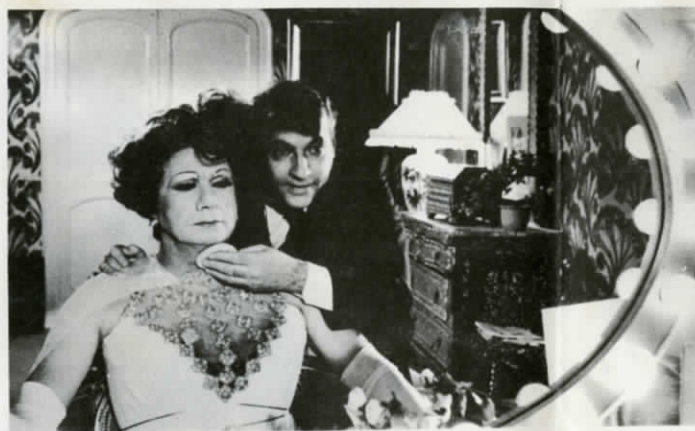
In a scene from La Cage Aux Folles , Albin (Michel Serrault, right) gives a new identity to Morals Squad Monsieur Charrier (Michel Galabru) in order to avoid hostile newspaper reporters — see Ritzzy Cinema panel

Rock Against Sexism concert, benefit for women's and gay groups. Women's band and disco. From 7.30-11.30pm at the Students' Union Building, City of London Polytechnic, 132 Whitechapel Road, E1