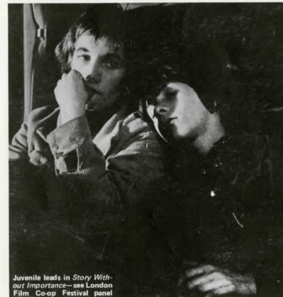
Juvenile leads in Story Without Importance — see London Film Co-op Festival panel

Festival at University of London Union, 2pm to midnight.