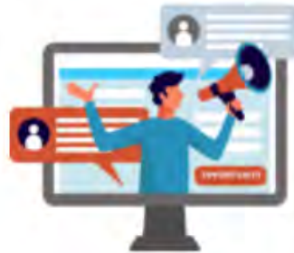
Matchmaking and Visibility