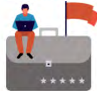
Services for Your Client Companies