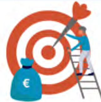
Meet and Connect