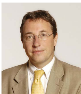
Achim Steiner Executive Director, UNEP Geneva, 8 October 2007 117th Assembly of the Inter-Parliamentary Union

“Ban Ki-Moon is determined to put global warming at the top of the global political agenda and determined to build the trust so urgently needed if we are to succeed in combating climate change. Under his leadership, the UN is also determined to demonstrate its 'sustainability credentials' by action on the ground and by good housekeeping at home.