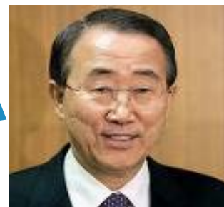
Ban Ki-Moon UN Secretary General New York, 5 June 2007 World Environment Day

We need to work on our operations too, by using energy more efficiently and eliminating wasteful practices. That is why, today, I am asking the heads of all UN agencies, funds and programmes to join me in this effort. And I am asking all staff members throughout the UN family to make common cause with me. ◆