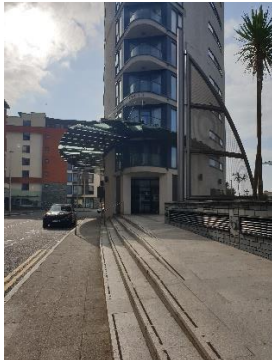
The entrance to your apartment is accessible via concierge at Meridian Tower (Accessible with key fob)