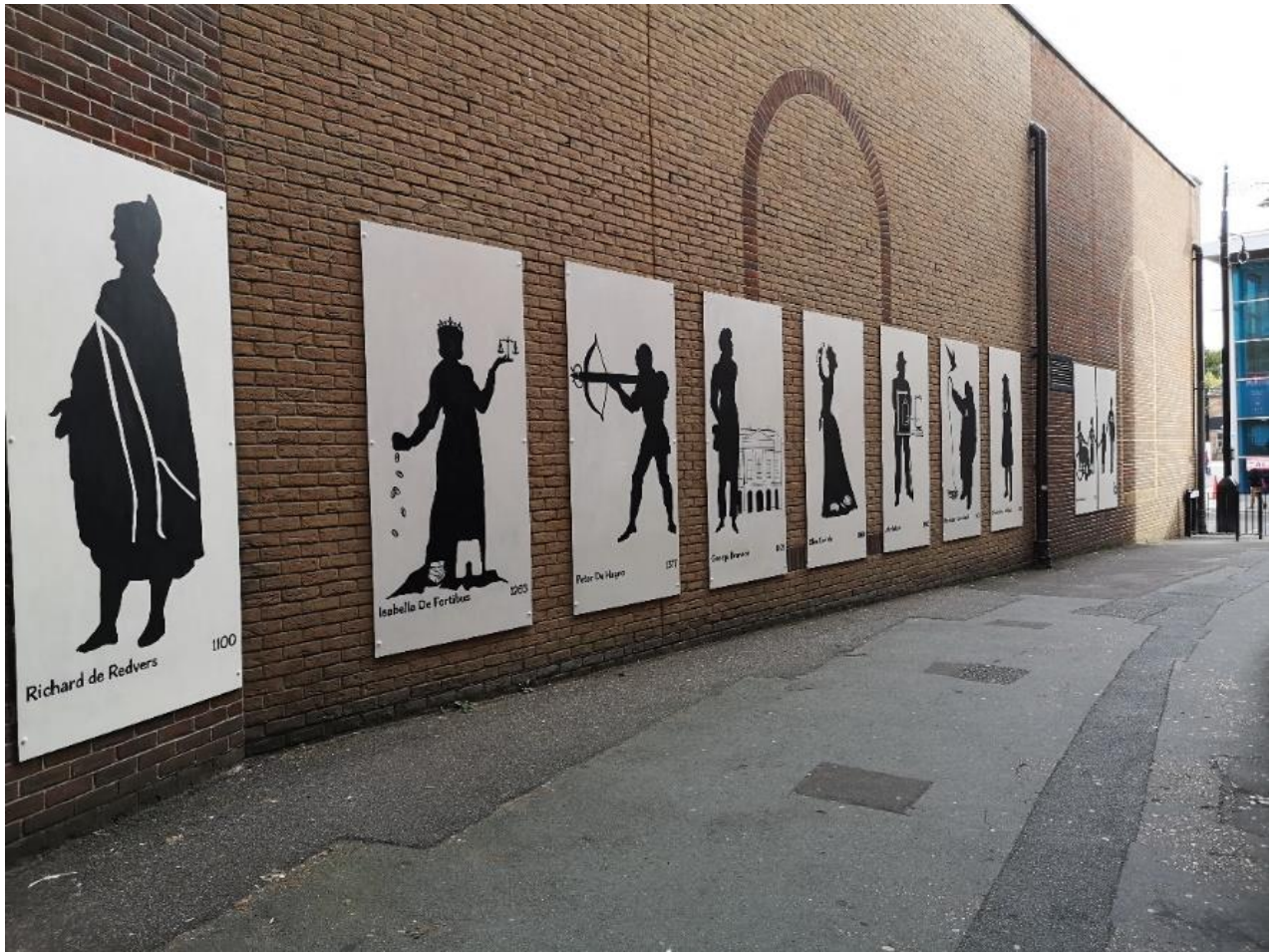
Cockram's Yard Noteable Newport' Murals