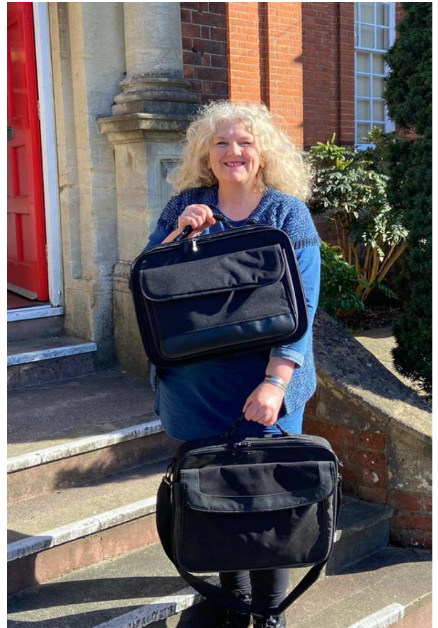
Laptops for Schools