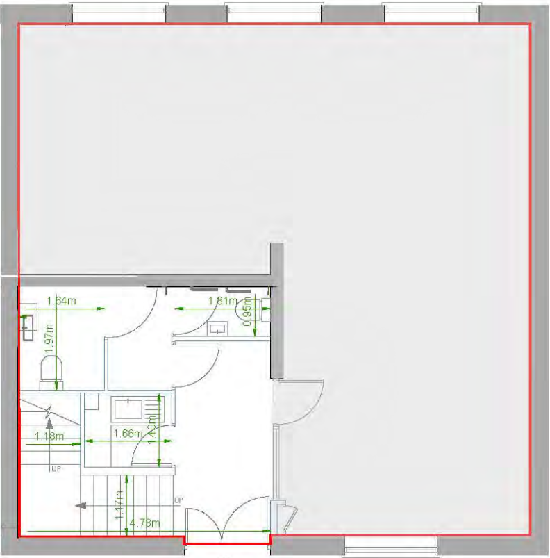
UNIT 2 ENTRANCE