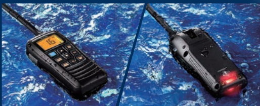
Float'n Flash function (front/back)

The radio floats with a flashing LED light to help you retrieve it from the water.