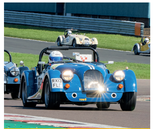
SSL Front and Rear Competition Suspension supplied and fitted by Techniques