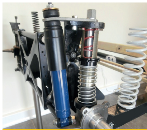
Morgan SSL Front Suspension Kit Supplied & fitted £895.00 + VAT