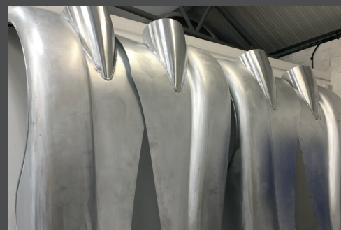
Morgan Super Form front and rear wings in stock.