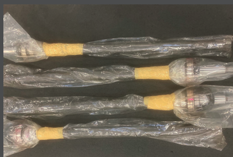
Morgan BTR Axle Shafts, with bearings & collars. £645.00 + VAT per set