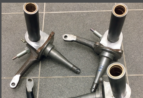
Stub Axles in stock. Suitable for steering rack and steering box Morgans.

Our fully qualified factory trained technicians have many years experience working on both late and early Morgan models.