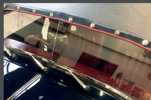
New Windscreens for all 2 or 4 seater Traditional Morgans and Aero models.

We also have some very good condition traditional 10 stud windscreens with new non heated glass fitted for exchange at £225.00 plus VAT or outright purchase at £300.00 plus VAT.