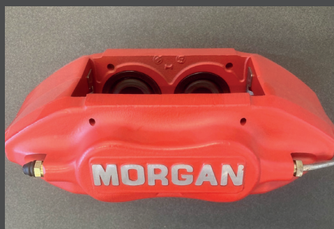
Morgan Aero 8 Brake Calipers in stock.