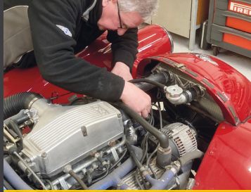
Morgan Service Centre

Our qualified factory technicians, with many years experience working on both early Morgan models and late CX platform cars, can undertake all of your Morgan servicing and maintenance requirements.