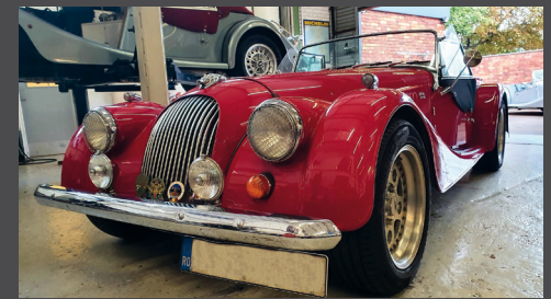
Morgan +8 from Romania Replacement clutch assembly and fitting of stainless steel fuel tank.