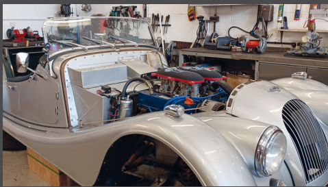
Morgan +8 from Switzerland Replacement engine and T5 gearbox conversion.

We regularly have visitors from abroad requiring our services and this summer has been no exception.