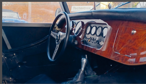
Morgan +8 from France LHD steering conversion and suspension/brakes upgrades.