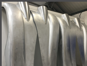
Morgan SuperForm Front and Rear Wings.