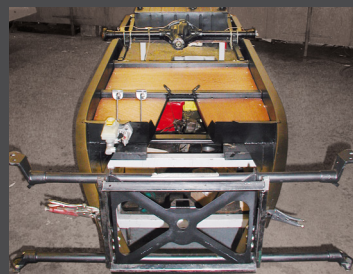
Morgan Factory Chassis