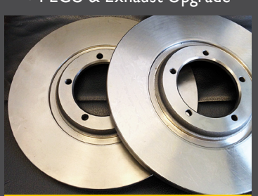
Morgan Brake Discs