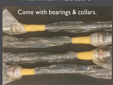
Morgan BTR Axle Shafts