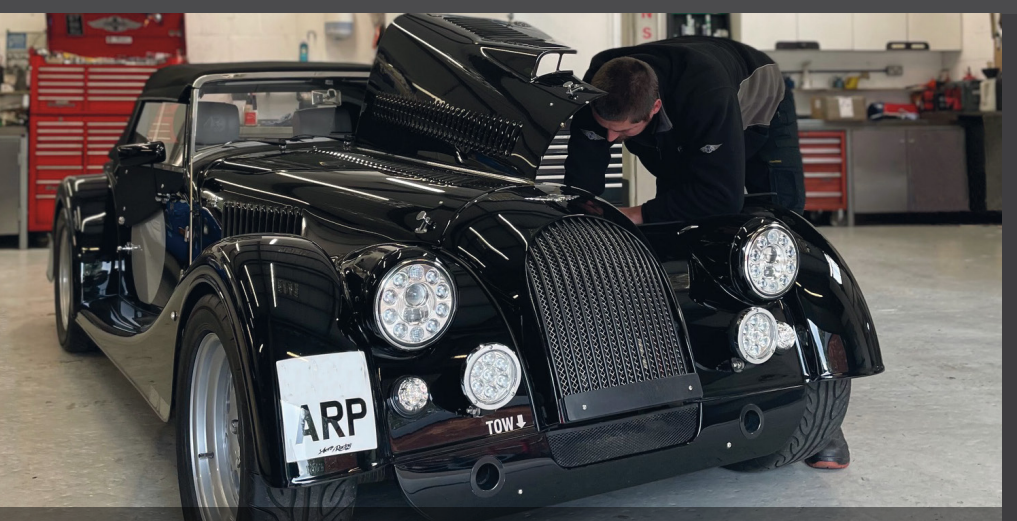
In our Workshop: A very rare Morgan ARP4 for service and general maintenance.