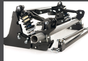
For improved comfort and road handling, Techniques can supply and install SSL suspension kits to your Morgan.