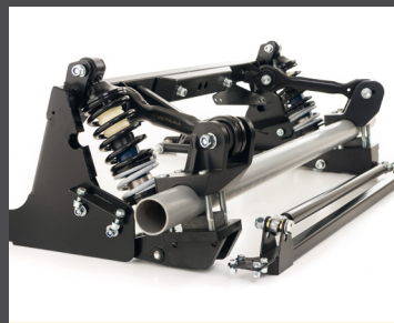
SSL Suspension Upgrades