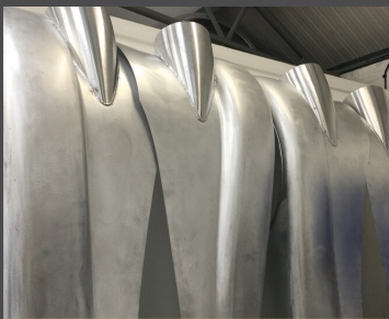
Morgan Super Form Wings