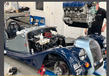
Race Car Development

Techniques has over 35 years experience looking after Morgans and our skilled technicians can carry out a variety of work to your Morgan, from routine maintenance and upgrades to accident repairs and race preparation.