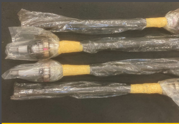
BTR Axle Shaft set, including Collars and Bearings per axle set £696.00 + VAT