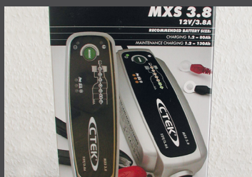
CTEK Battery Conditioner/Charger £69.95 + VAT