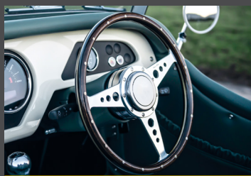
Moto-Lita Steering Wheel with holes or slots £195.00 + VAT