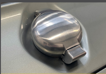
Morgan Aero 8 Fuel filler Cap £396.00 + VAT Fitted