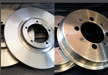
Genuine Morgan Brake Discs and Brake Drums in stock.