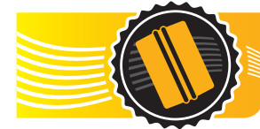
3M Endorsed Installer

Our 3M™ MCS™ Partners provide finished graphics that are produced using 3M films, inks, protective films/coatings, and certified printers to guarantee quality and consistency.