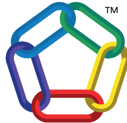
3M™ MCS™ Warranty

We have developed an unparalleled ability to measure and analyse some of the toughest environmental conditions through our sixteen weathering resource centers, guaranteeing our customers maximum quality and durability.