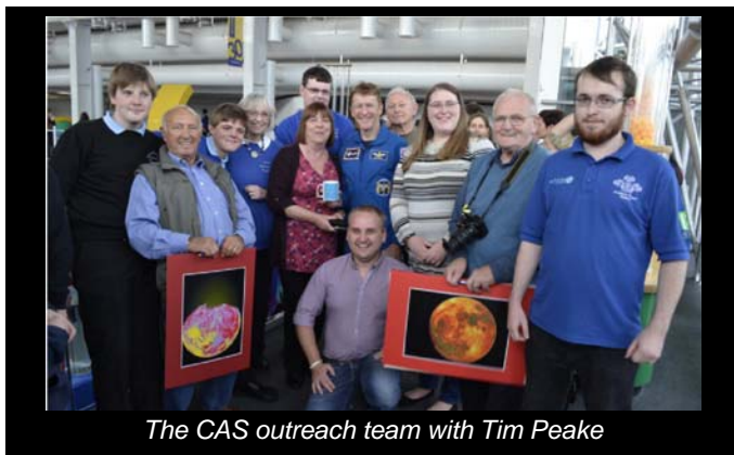
The CAS outreach team with Tim Peake

The map on page 14 shows the location of the Cardiff University Physics and Astronomy Department where the talks are held. It's easy to get to (just off Newport Road) and close to bus and train routes. Ample car parking is available nearby. If in doubt contact a Committee Member. Contact details are listed on the Officers and Trustees page on the website. Please make every effort to attend as it is encouraging to have a large audience and makes it easier for the Society to continue to attract the best speakers. We welcome volunteers, from the membership, who are happy to share their enthusiasm and expertise on a particular subject, by giving other members a short talk.