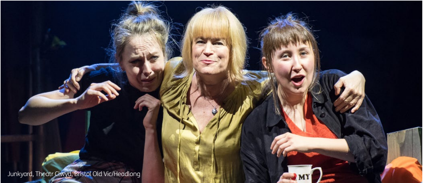
Junkyard, Theatr Clwyd, Bristol Old Vic/Headlong