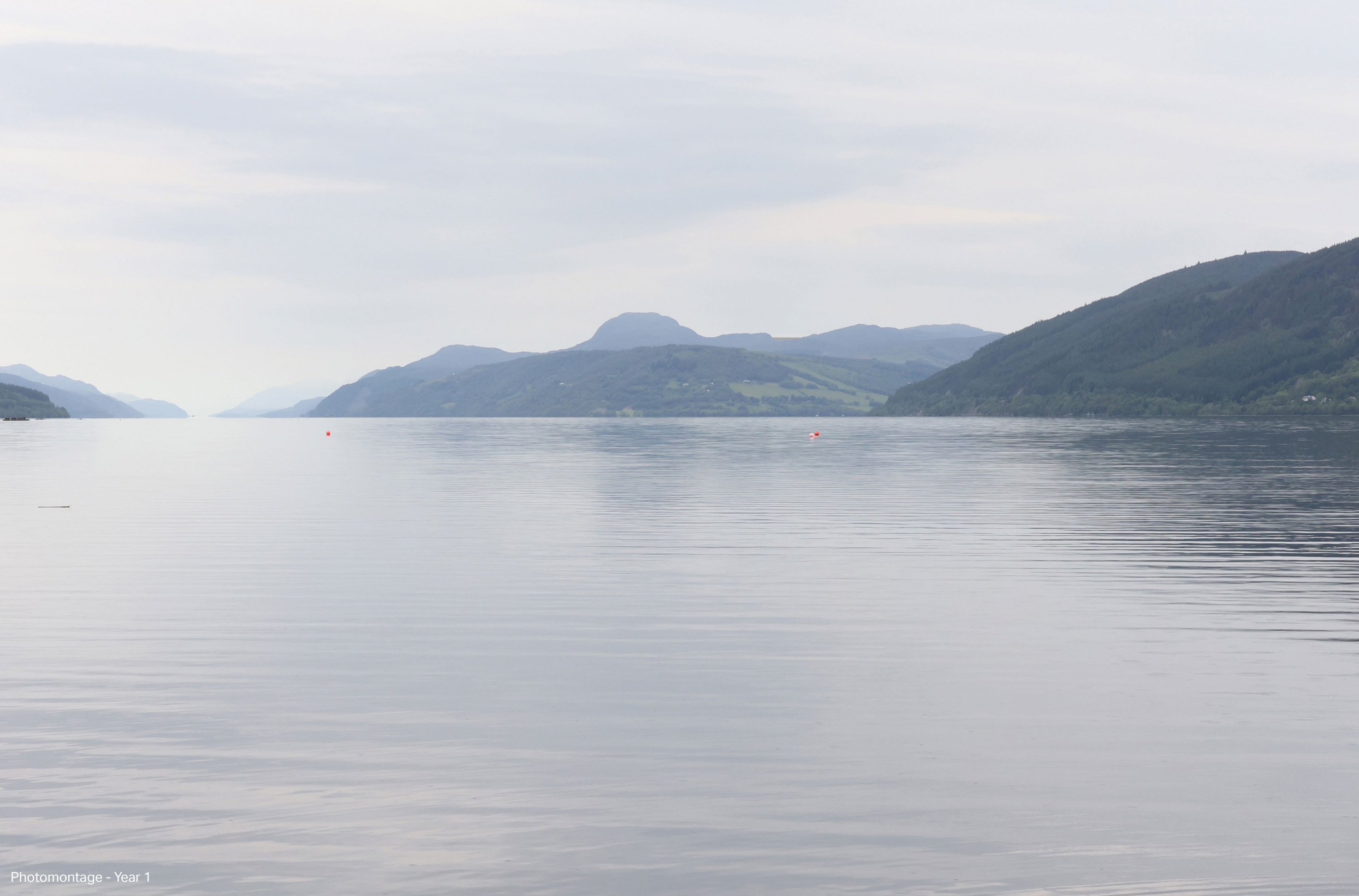
Photomontage - Year 1

This image should be viewed at a comfortable arm's length (approx. 500mm).