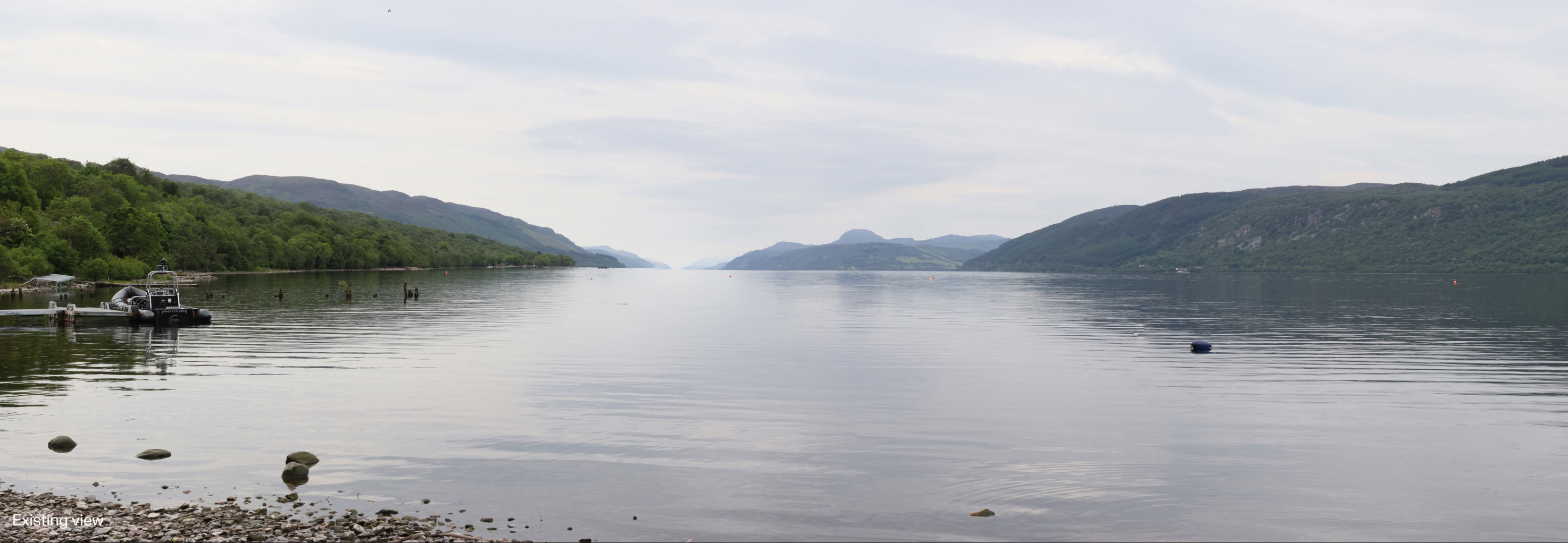
Viewpoint 7: Dores Beach

Camera: Canon EOS R5 Focal Length: 50mm vertical (27°) x 28mm horizontal (65.5°) Camera height: 1.5m Date: 11/06/2025 Time: 07:42 Distance to headpond: 18.4km Distance to LCW: 17.4km