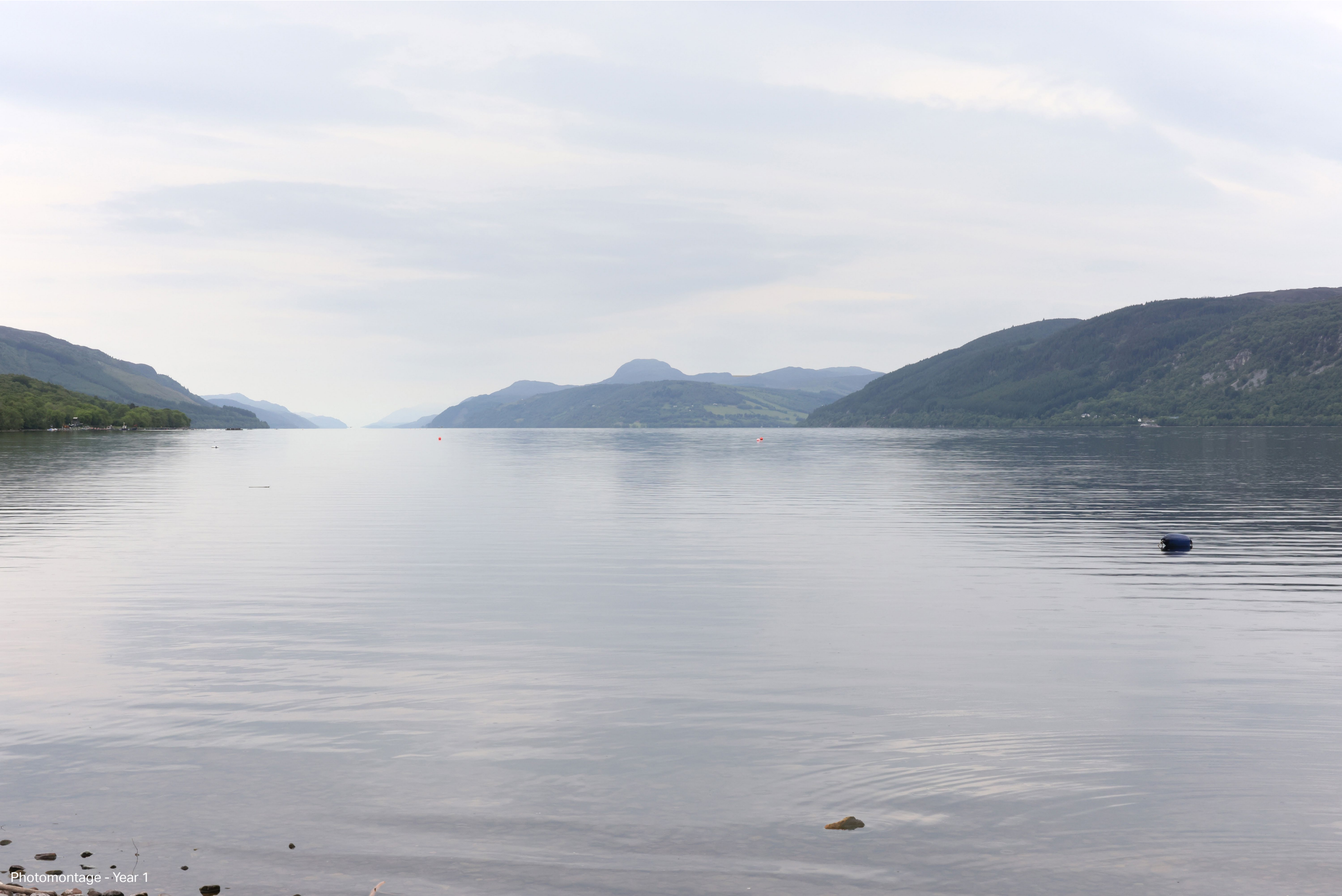
Photomontage - Year 1

When viewed at a comfortable arm's length (approx. 500mm), this printed image is representative of our detailed central vision, but is not representative of scale and distance.