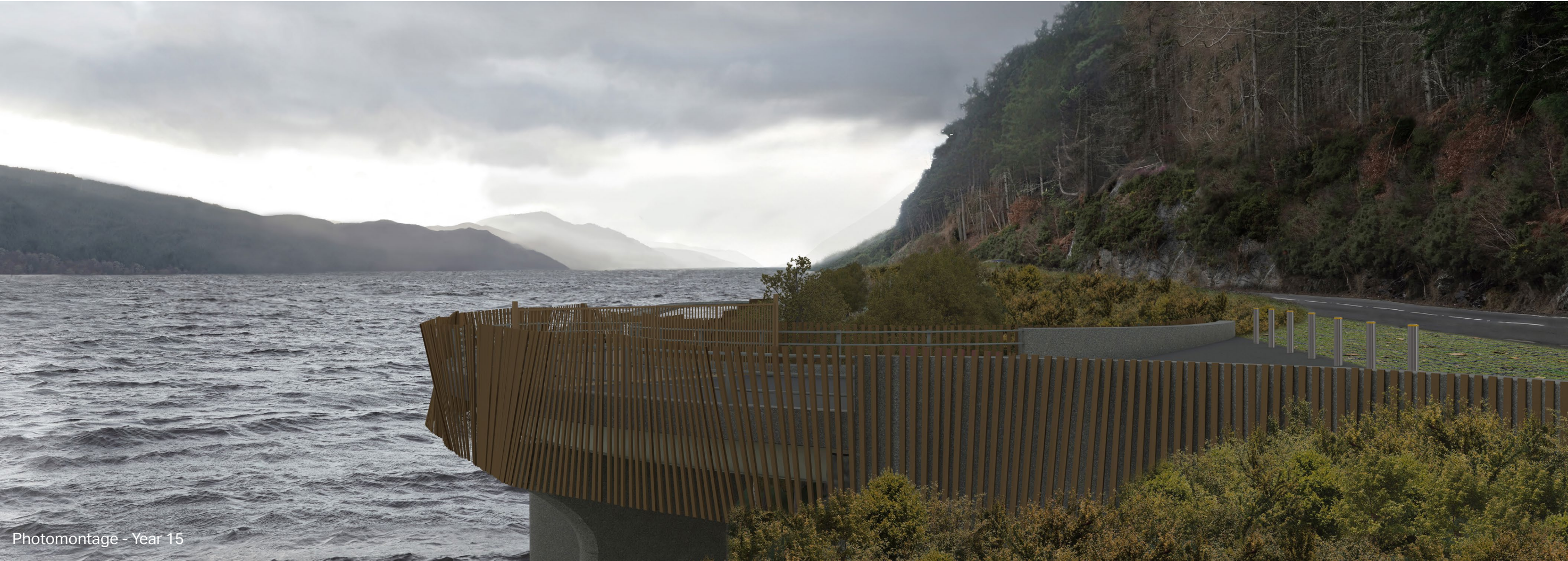
Viewpoint 13: A82 layby

Camera: SONY ILCE-9 Focal Length: 50mm vertical (27°) x 28mm horizontal (65.5°) Camera height: 1.5m Date: 16/01/2025 Time: 14:02 Distance to headpond: 2.5km Distance to LCW: 14m