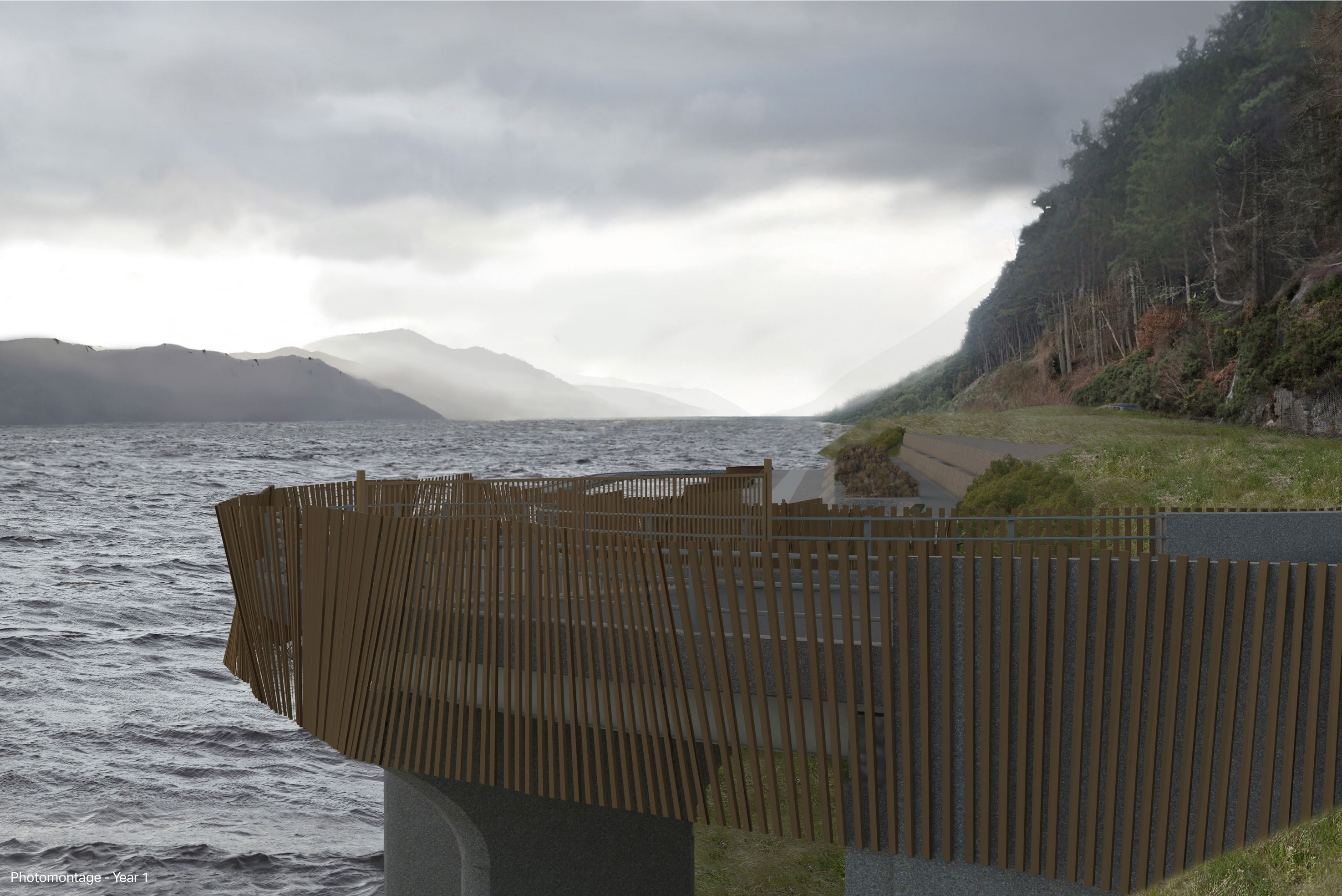
Viewpoint 13: A82 layby

When viewed at a comfortable arm's length (approx. 500mm), this printed image is representative of our detailed central vision, but is not representative of scale and distance.