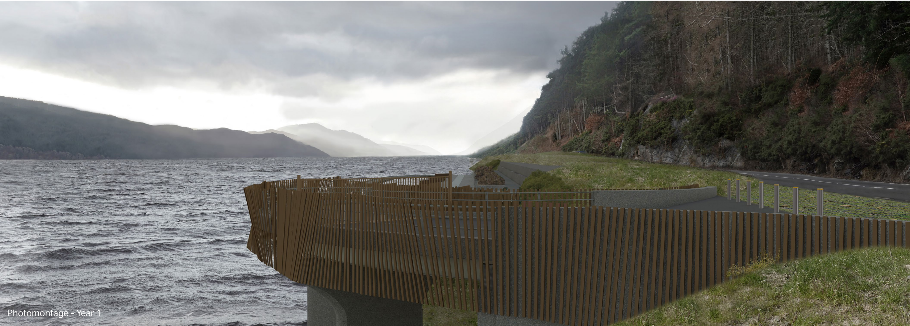
Viewpoint 13: A82 layby

Camera: SONY ILCE-9 Focal Length: 50mm vertical (27°) x 28mm horizontal (65.5°) Camera height: 1.5m Date: 16/01/2025 Time: 14:02 Distance to headpond: 2.5km Distance to LCW: 14m