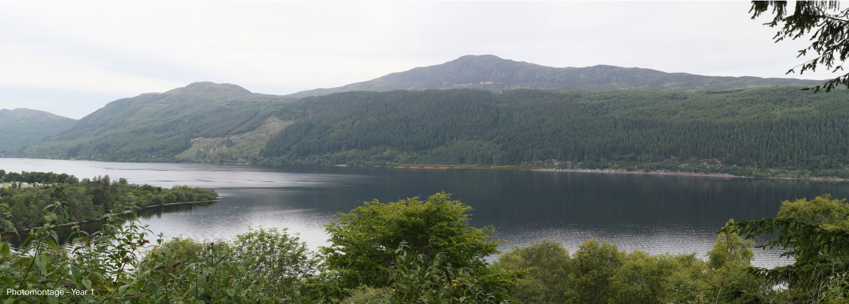
Photomontage - Year 1