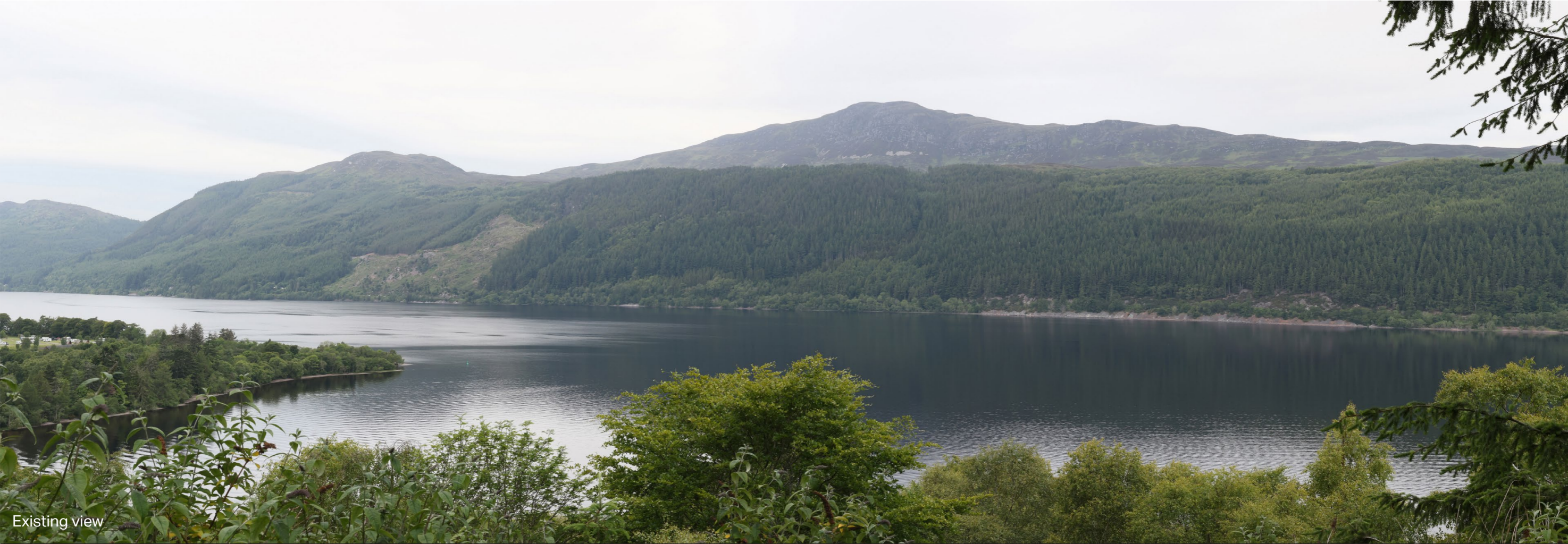
Viewpoint 2A: Settlement of Foyers

Camera: Canon EOS R5 Focal Length: 50mm vertical (27°) x 28mm horizontal (65.5°) Camera height: 1.5m Date: 11/06/2025 Time: 10:02 Distance to headpond: 4.6km Distance to LCW: 2.2km