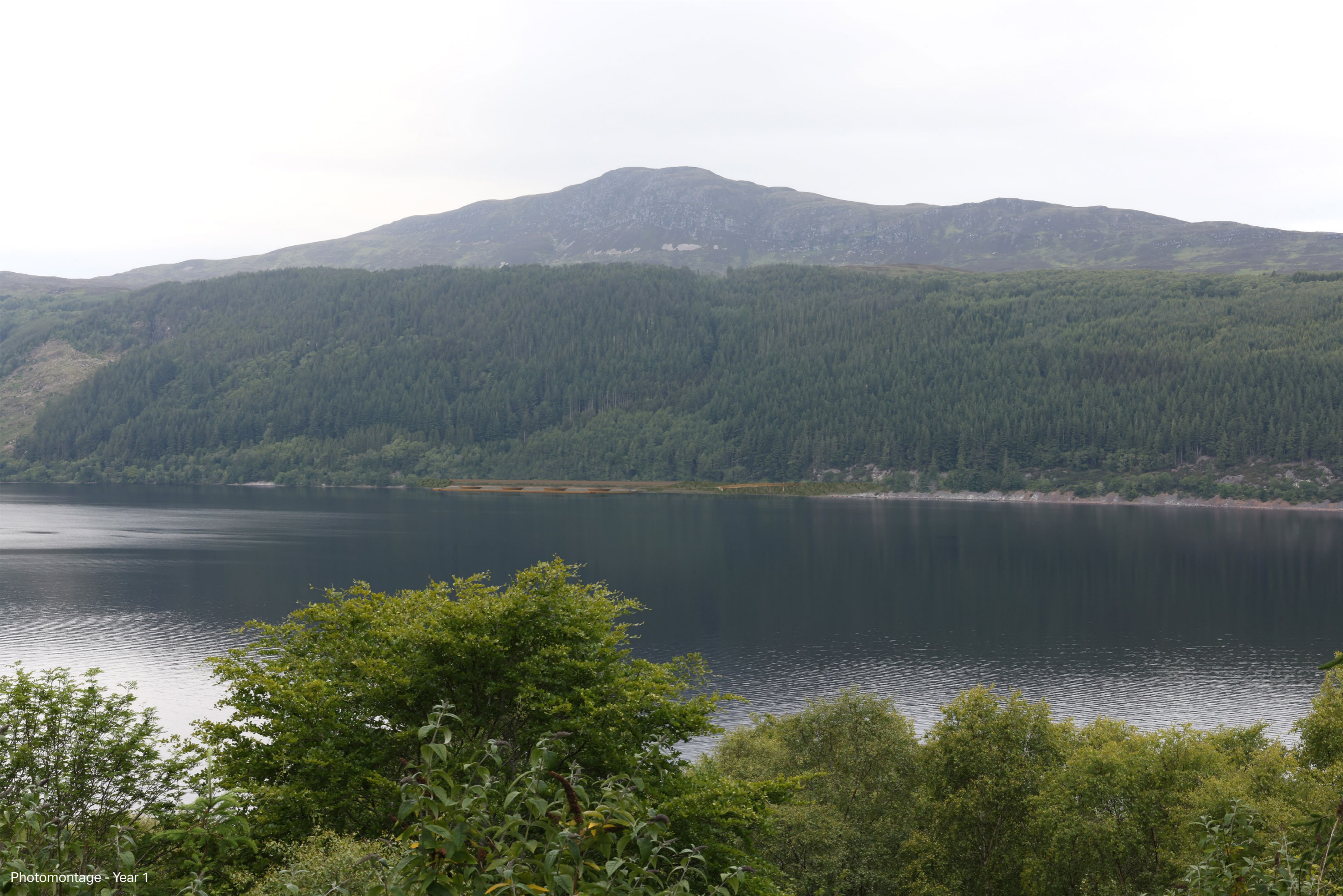
Photomontage - Year 1

When viewed at a comfortable arm's length (approx. 500mm), this printed image is representative of our detailed central vision, but is not representative of scale and distance.