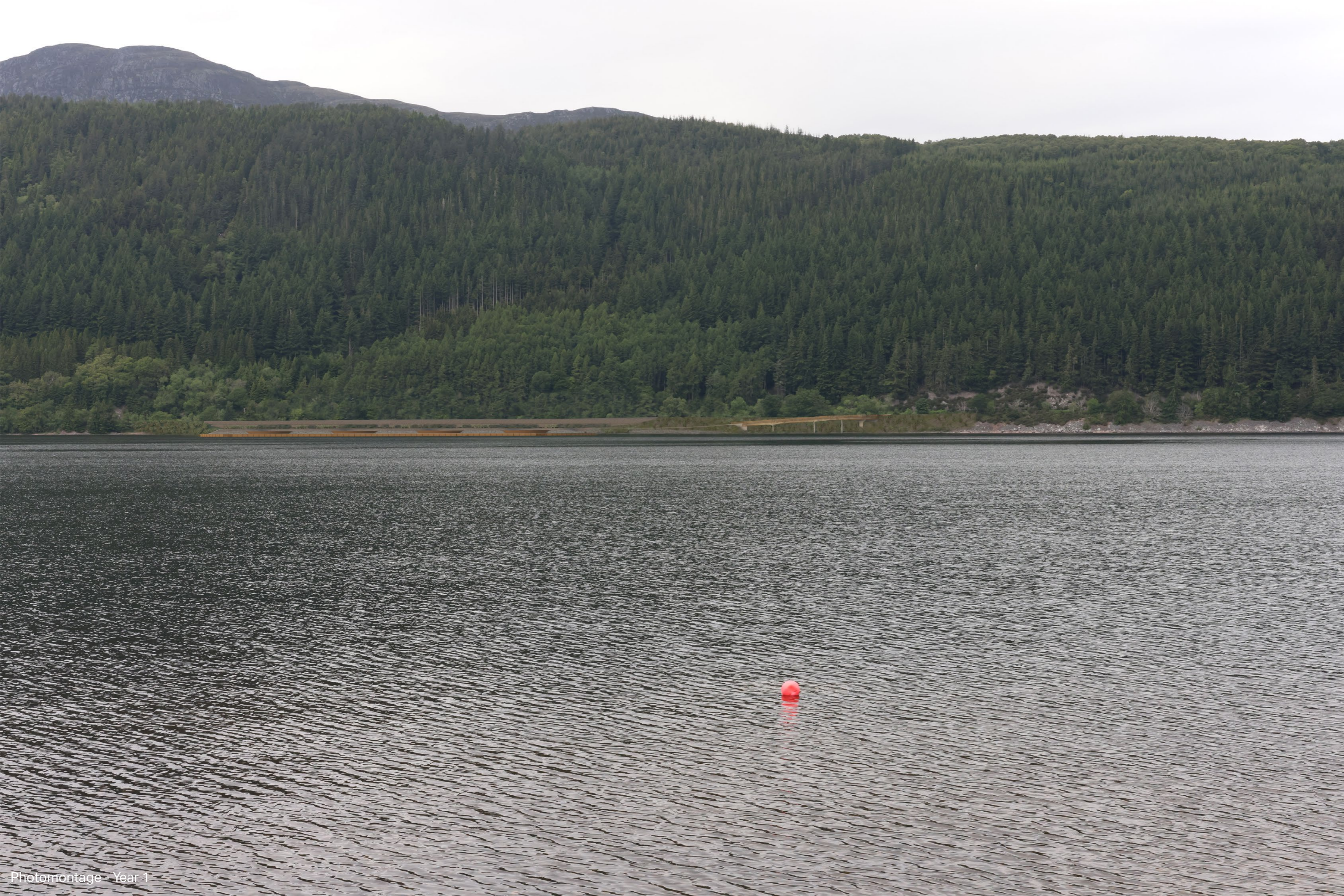
Photomontage - Year 1

When viewed at a comfortable arm's length (approx. 500mm), this printed image is representative of our detailed central vision, but is not representative of scale and distance.