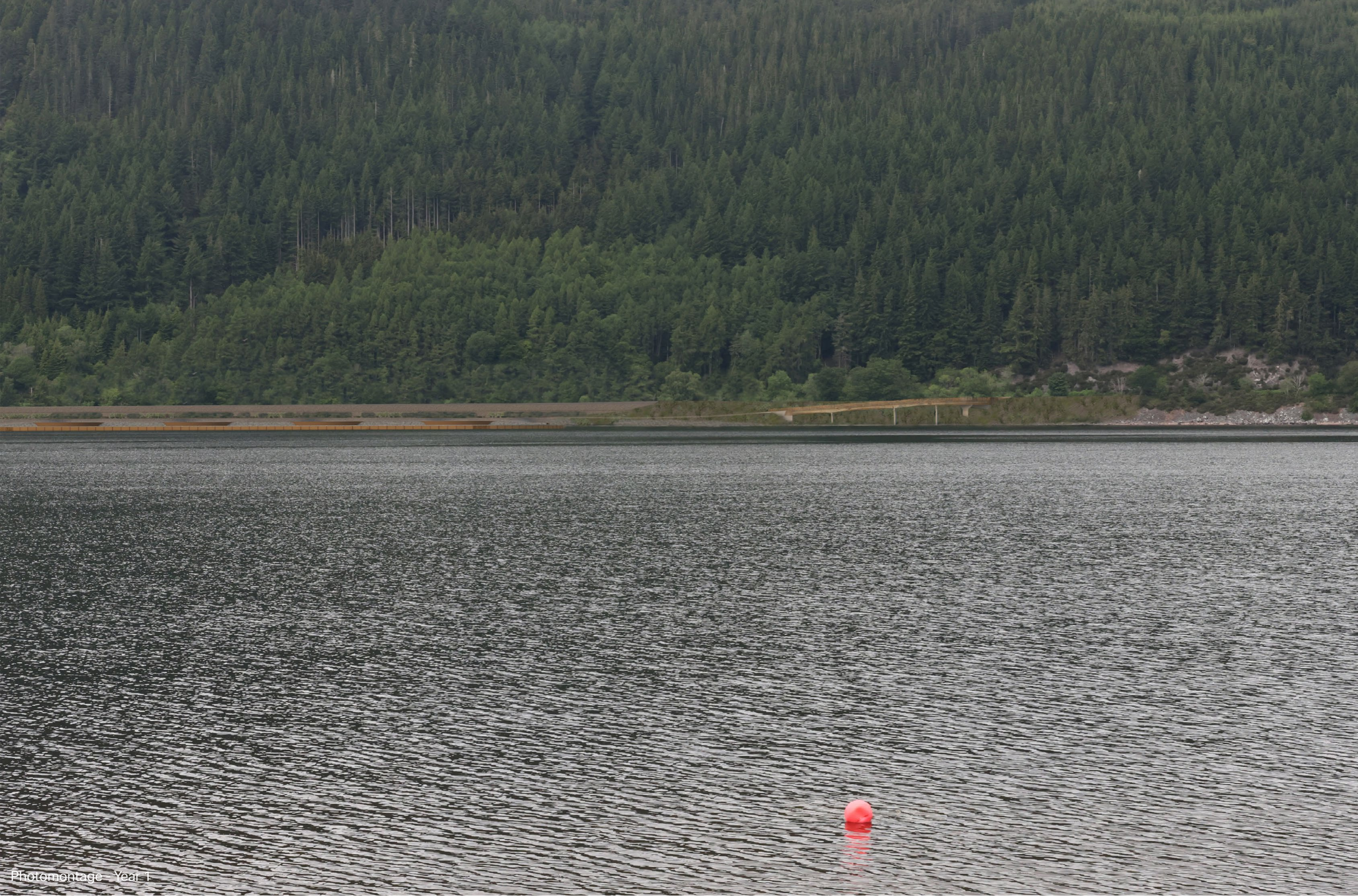
Photomontage – Year 1

This image should be viewed at a comfortable arm’s length (approx. 500mm).