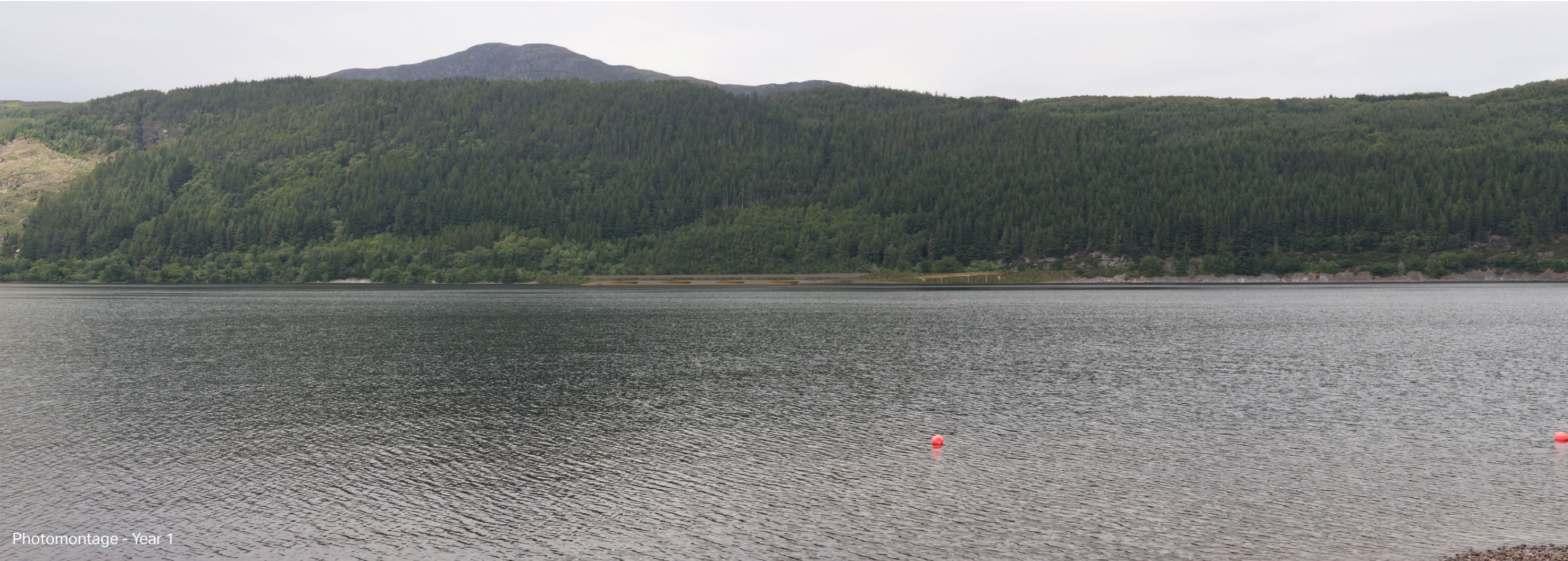
Photomontage - Year 1