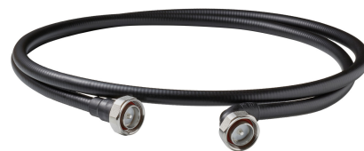
7M7MRL12F-0300FFP for EXAMPLE

ANATEL standard compliant jumpers available on request. Model number suffix xxx-ANA.