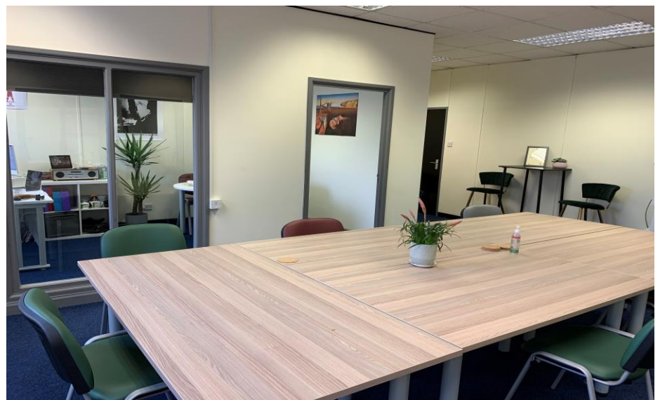
Main office/meeting area

Calderdale LMC now have offices which are based in Dean Clough and became a limited company on the 09 th April 2021.