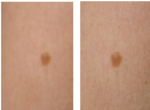
OUT OF FOCUS