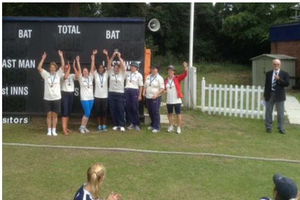
-2014 softball festival tournament winners "Sutton Adorables"-