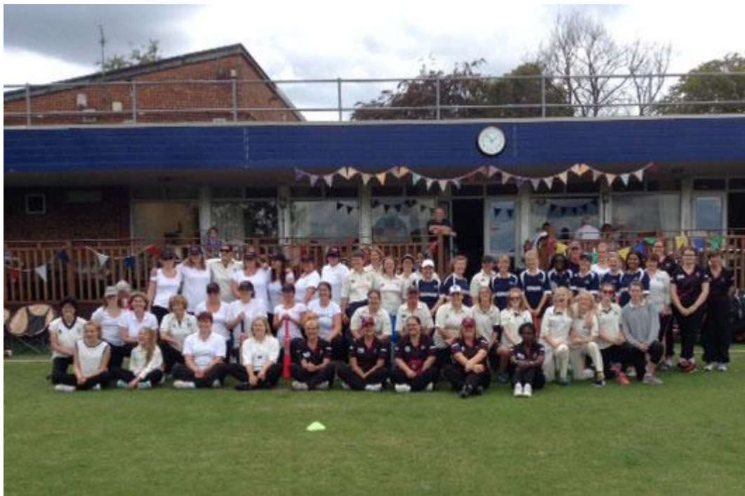
-The competing teams group picture-

In addition to the Sutton Women's squad divided into two teams A and B, fetchingly nick-named the Adorables and the Beauties, the Festival welcomed the ladies teams of South Nutfield, Godalming, Bushy Park and Outwood.