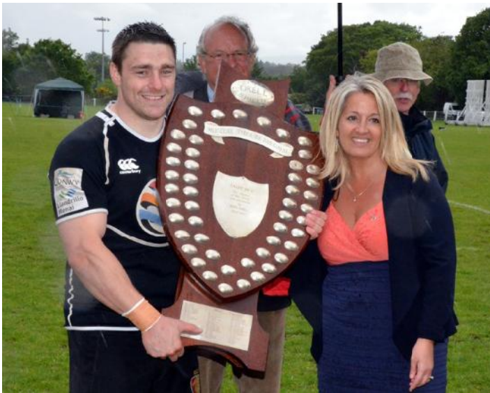
Pictures from the Caldys 7's