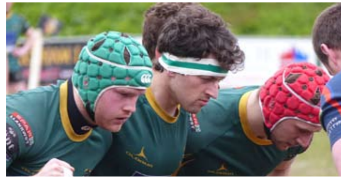
Nant Conwy 20 v Bala 9