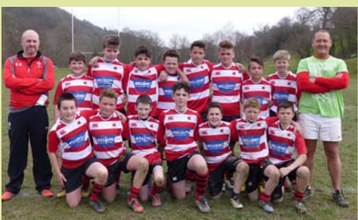
NEWTOWN, BUILTH WELLS, WELSHPOOL, LLANIDLOES