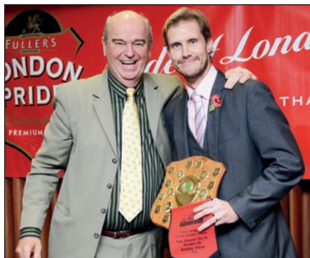
Whiteley Village CC, 2nd XI First Division Runners Up