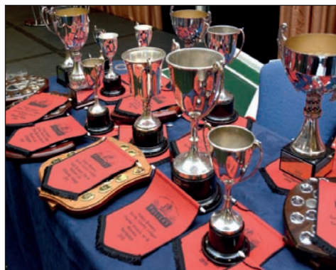
Left: Trophies waiting to be claimed