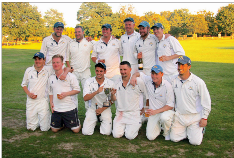
Haslemere CC celebrate their League Cup victory