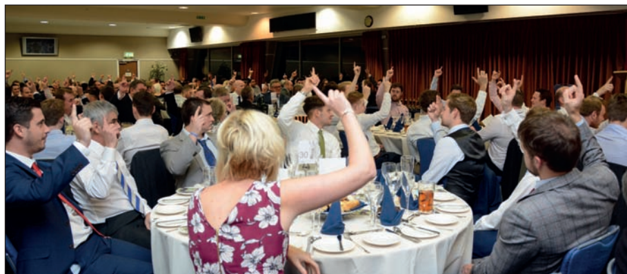
Hands up if you're having a good time! A full house at the Annual Dinner