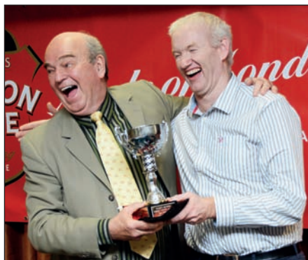
Sheen Park CC, 2nd XI Second Division Champions