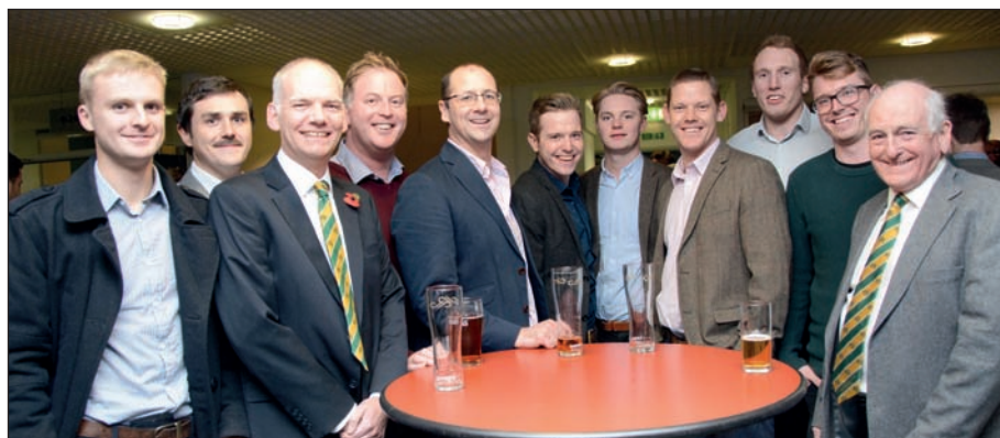
Effingham CC enjoying a drink together