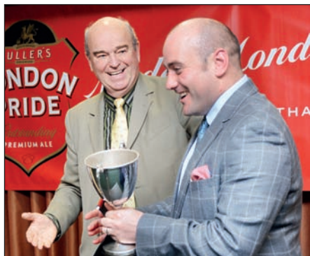
Kempton CC, 1st XI Premier Division Champions