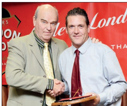
Frimley CC, 1st XI First Division Runners Up