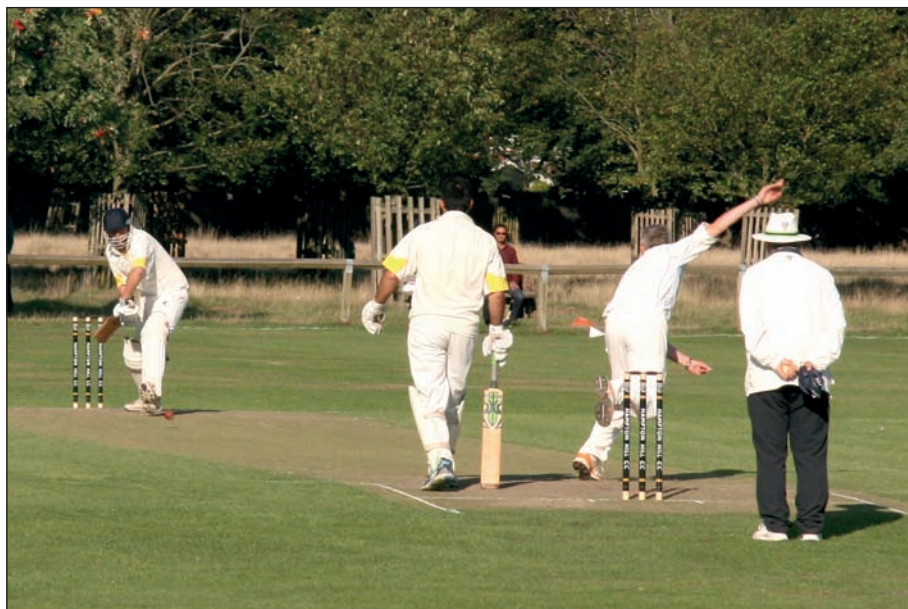
Frimley chase Haslemere's 181 as umpire Stuart Todd looks on in the League Cup Final