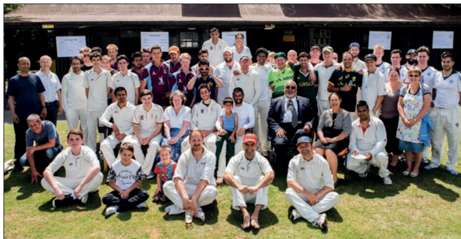
Above: Merton CC celebrate their 125th Anniversary with a six-a-side competition