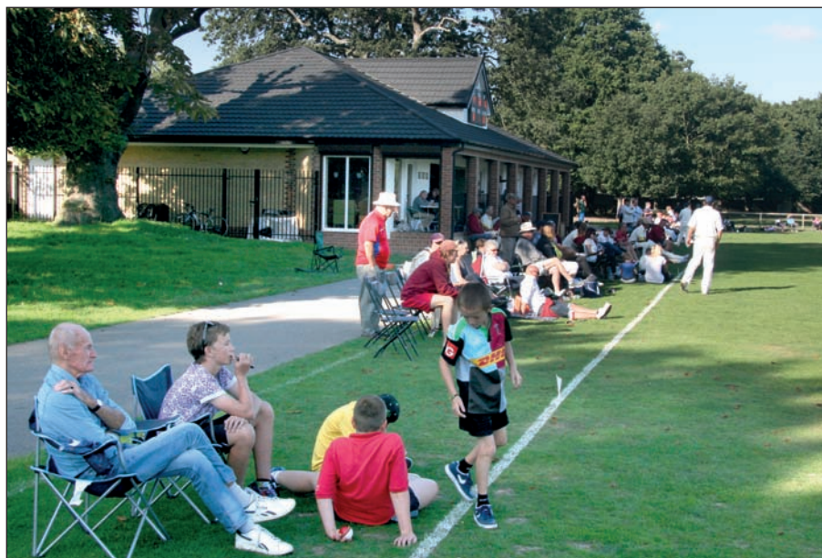
Spectators enjoying the League Cup Final at Hampton Hill CC