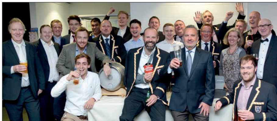
Hampton Hill CC turn out in force for the League Dinner