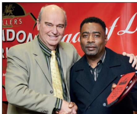
John Fisher CC, 1st XI Third Division Runners Up