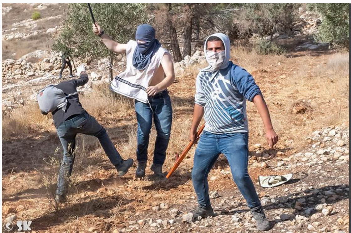
A settler attack near Surif, West Bank. November 2021.