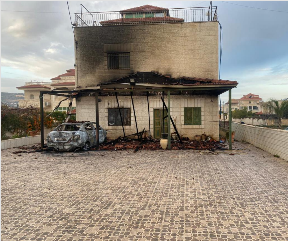
In Turmusayya, a destroyed car and severely damaged home following a settler arson attack on the night of January 28.