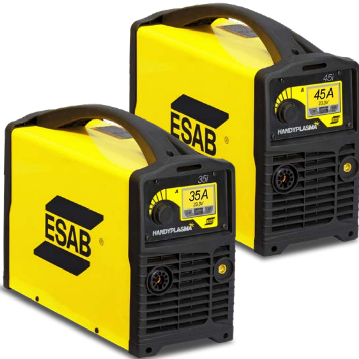
HandyPlasma 35i / 45i