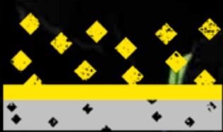
REPLACEABLE 2-STAGE TH2P LEVEL FILTRATION

The advanced Air system uses a push-button, digitally-controlled airflow adjustment, allowing from 170 liters per minute to 230 liters per minute through a spark arrestor shield and 2-stage replaceable filter. A high-capacity rechargeable lithium-ion battery powers the quiet (70 db) blower system for up to 8 hours between charging.