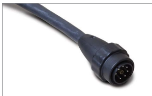
Handheld torch lead with quick disconnect.