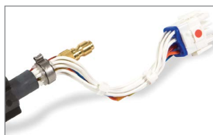
Easy Torch Removal (ETR) connection – makes Duramax retrofit torches easy plug-and-play upgrades

For more information, visit: www.hypertherm.com