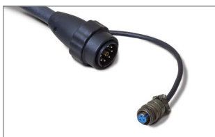
Mechanized torch lead with quick disconnect.