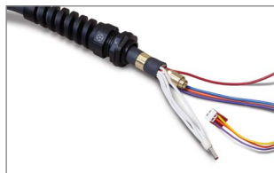
Handheld or mechanized torch lead without quick disconnect for Powermax600 CE systems.