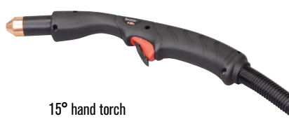
15° hand torch