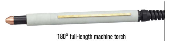
180° full-length machine torch

* When compared with standard T60/T80/T100 torches and/or consumables for Powermax1000/1250/1650.