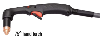
75° hand torch