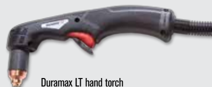
Duramax LT hand torch