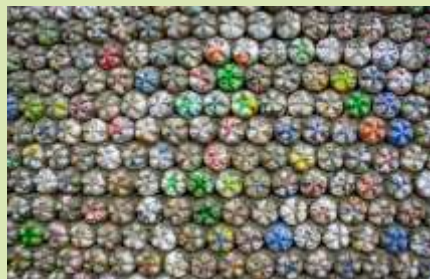
Above: An example of an eco-brick wall!