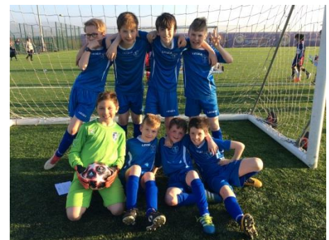
Our brilliant football team! We finally beat the brilliant Dunchurch team too!

This is taking place on Wednesday 10 th April at 2pm in the school Hall. Parents may attend this solome but important reflection.