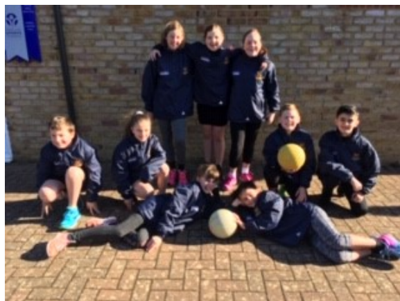
Netball team in their new sponsored jackets.