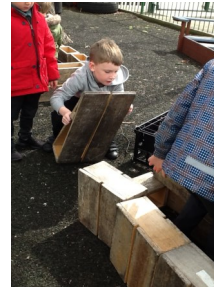
Building a dinosaur trap

Who knows where the children's ideas will take us next!